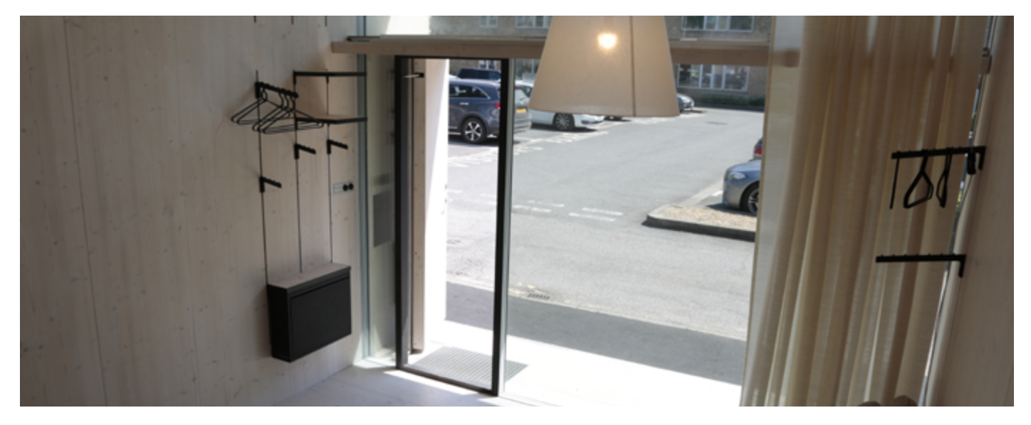
Hertfordshire Offsite Manufacturer Prospectus

By providing this pipeline certainty to an offsite manufacturer, the housing providers would expect to secure the certainty they need in speed and quality of delivery of new homes.